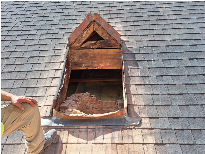
Chimney demo continued