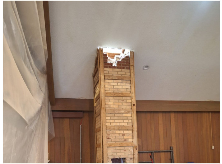
Chimney demo inside Nave