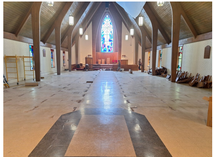
Pews disassembled and removed from the Nave