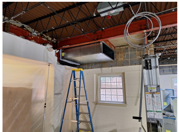
Tie in new ductwork to the existing.