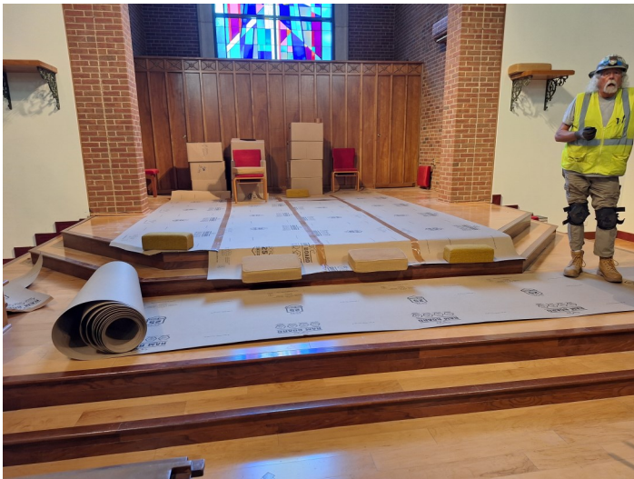
Altar protection in progress