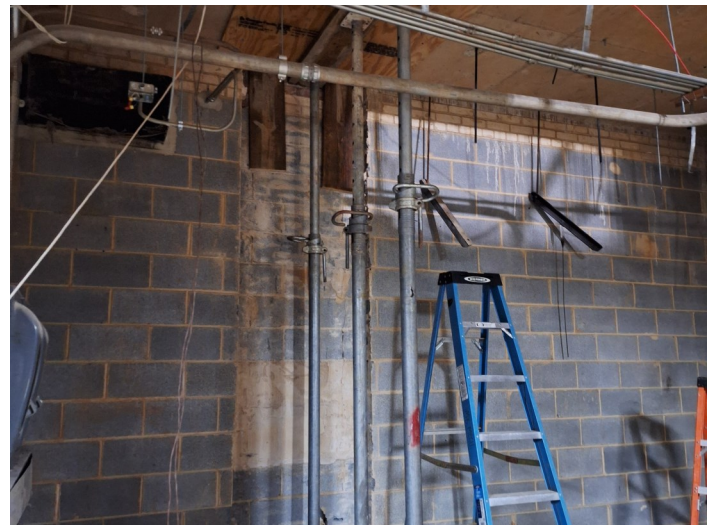
Post support for concrete forms