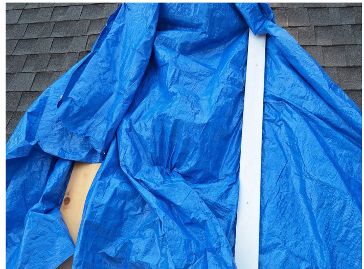
Chimney penetration roof protection