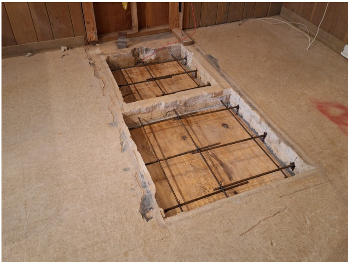
Concrete formwork and rebar.