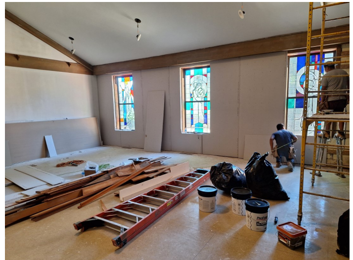
Drywall installed at the Narthex