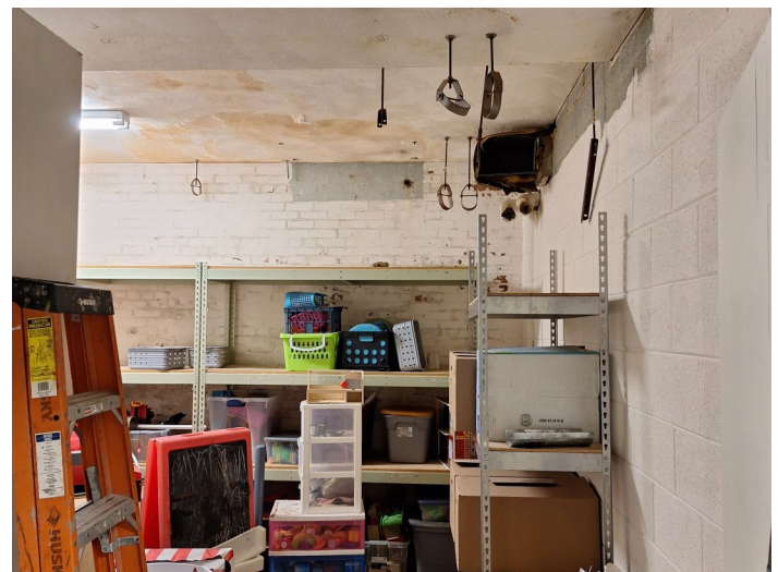
Storage room 125 mechanical demolition