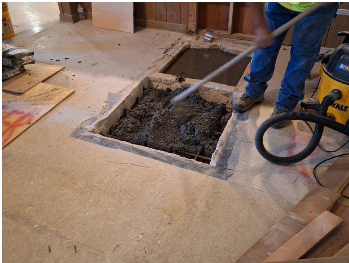
Concrete poured at chimney penetration