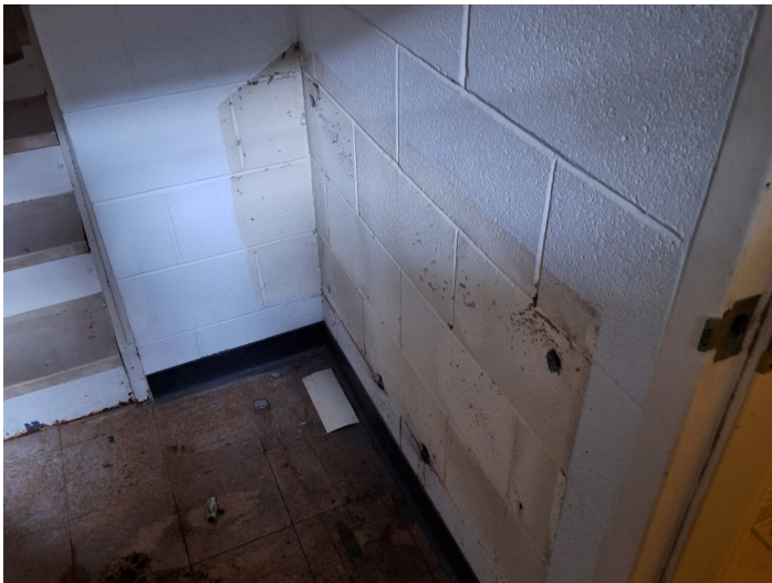
FCU removed in back hallway by the Alter