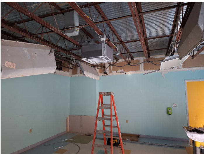
New VRF unit installed in classrooms