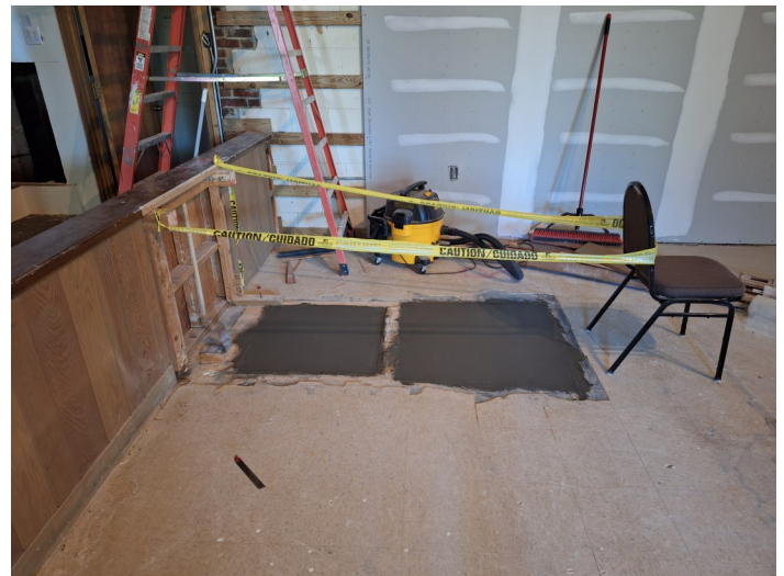
Concrete finished at chimney penetration