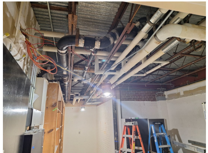
Mechanical Room 3 ceiling removed.