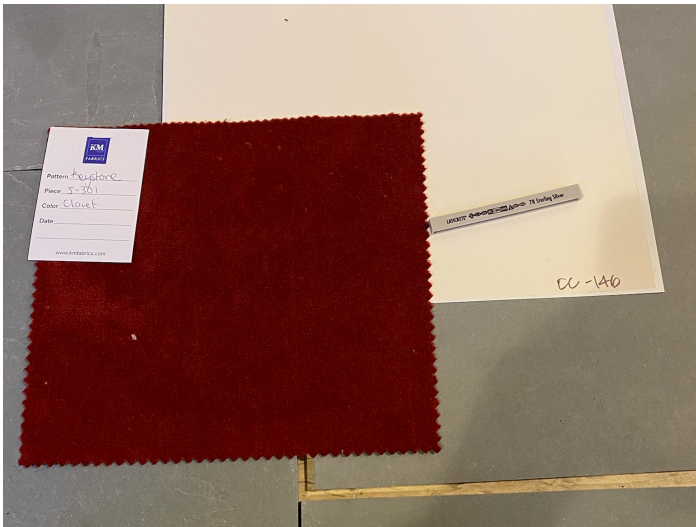
Fabric and Slate floor grout color selection