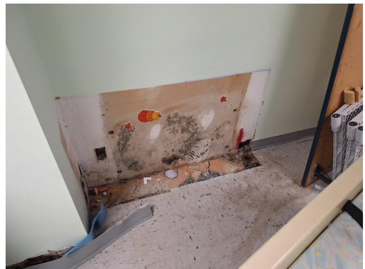
FCUs removed on the 1st floor.