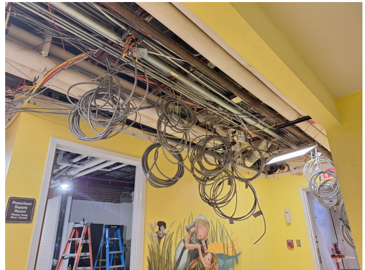
Pulling wire for new units