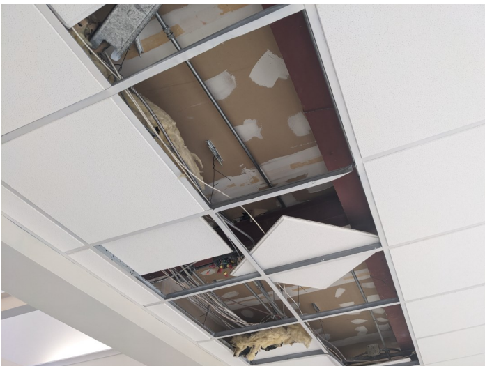
VRF unit will not fit in the proposed location. New location proposed in the attic space