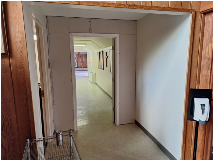
Temporary door installed at Rector's Gallerys