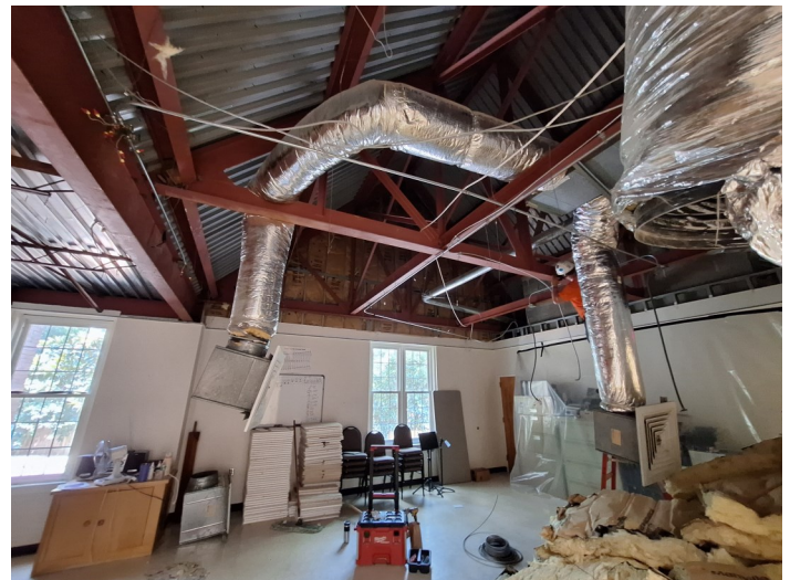
Ceiling removed in the choir room