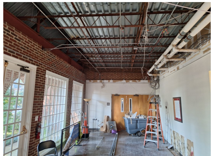
Ceiling removed in the breezeway