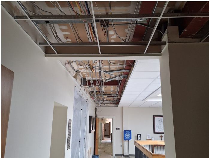
Ceiling removed in the choir corridor