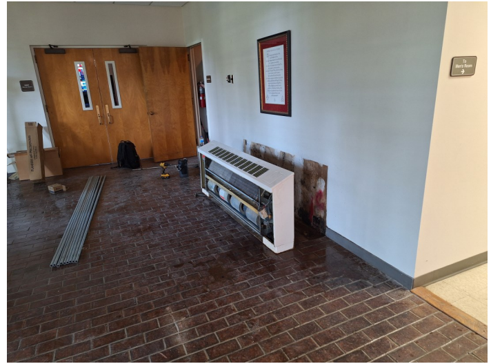
FCU removal in the breezeway