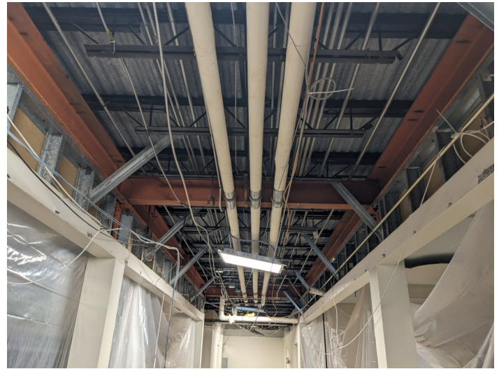
FCU and chiller piping removed.