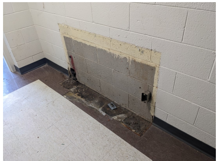
FCUs removed on the 1st floor.