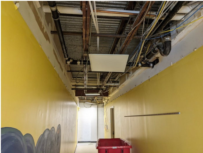
Corridor grid and tile removed