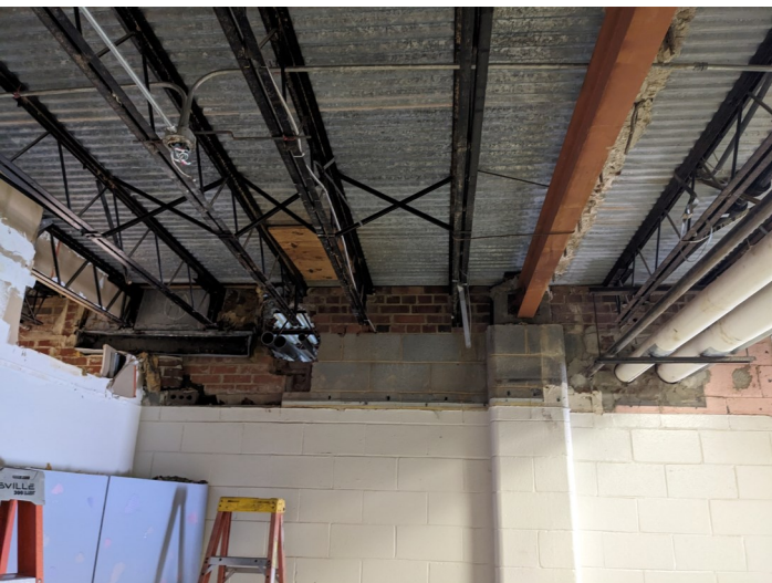
Existing ductwork removed in classroom.