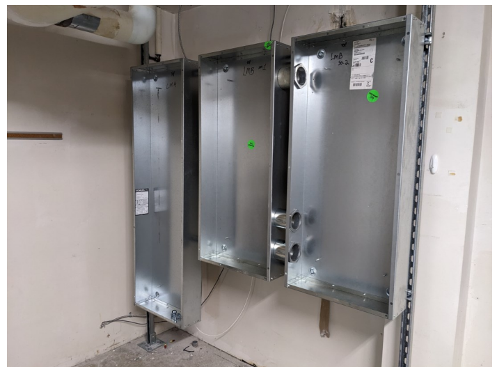
Electrical panel boxes have been installed.