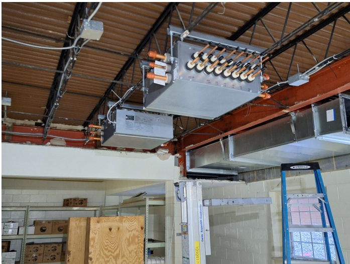
Valve control box for refridgerant.