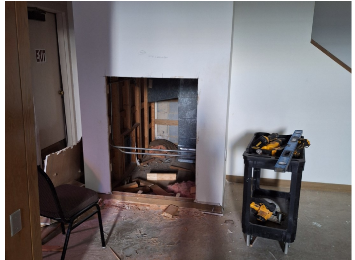
Return register cut under choir loft stairs