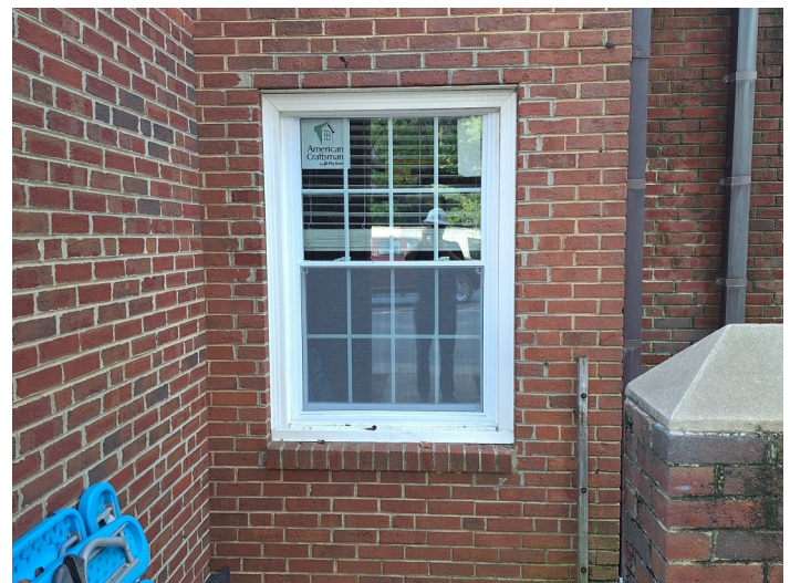
Preschool window replaced