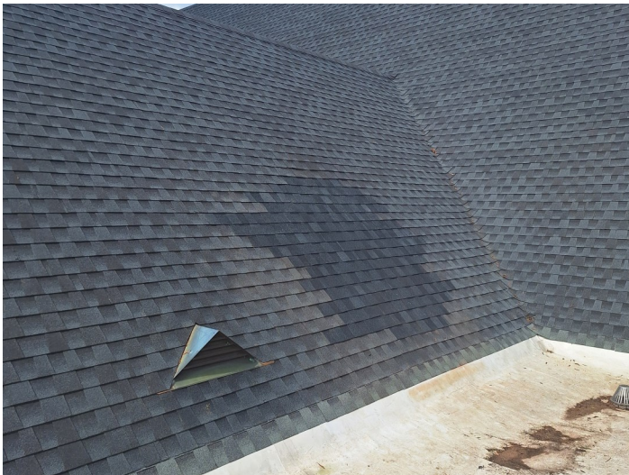
Chimney penetration repaired