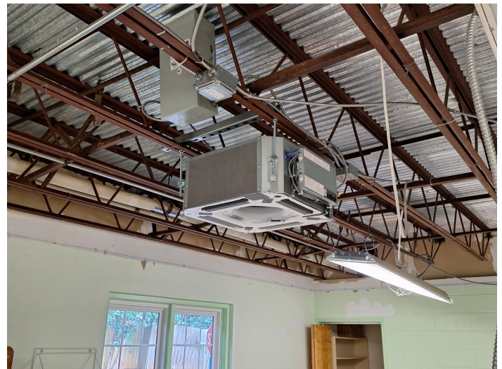
Ceiling mounted VRF unit installed.