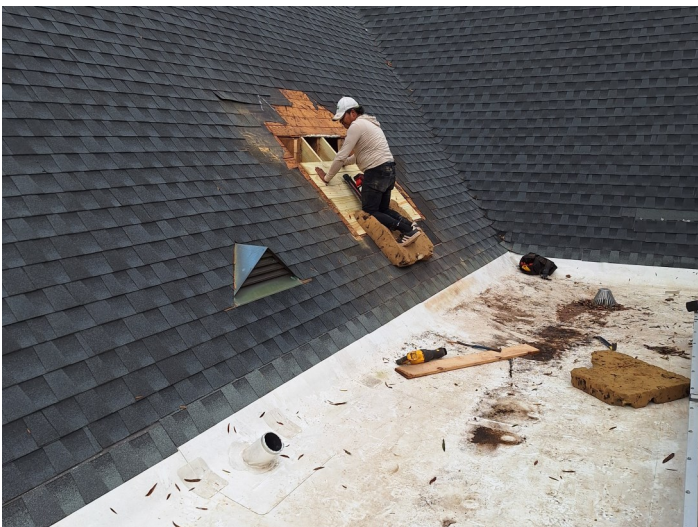
Sheathing chimney penetration repair