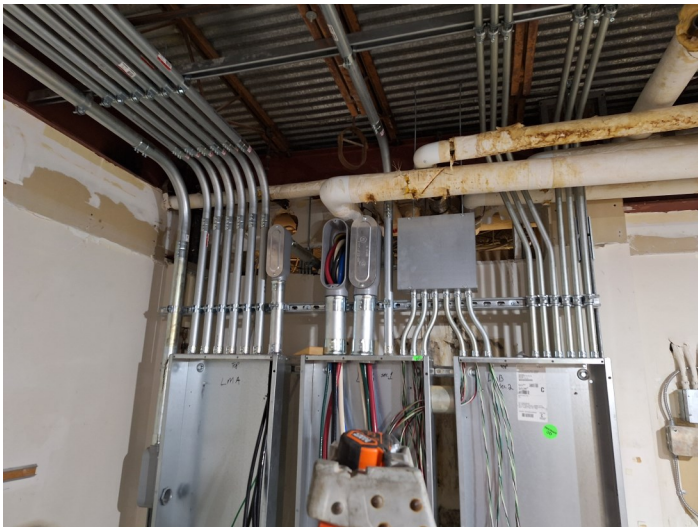
Installing new electrical conduit