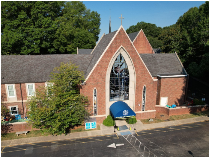
Main entrance access