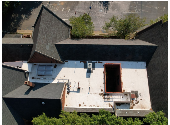
Existing roof conditions