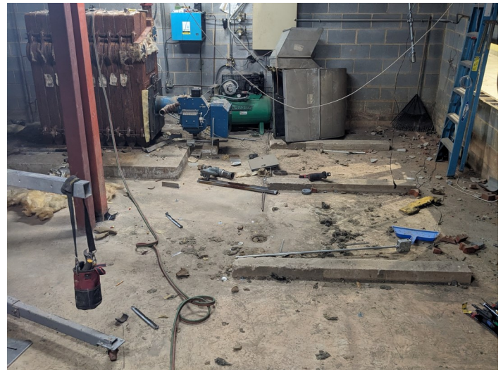
Equipment removed in boiler room