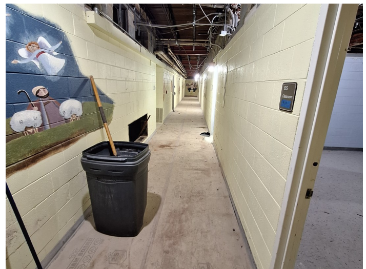
Ductwork removed in hallway